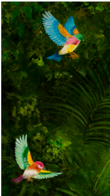
Detail of Natural Buddha with Wildlife